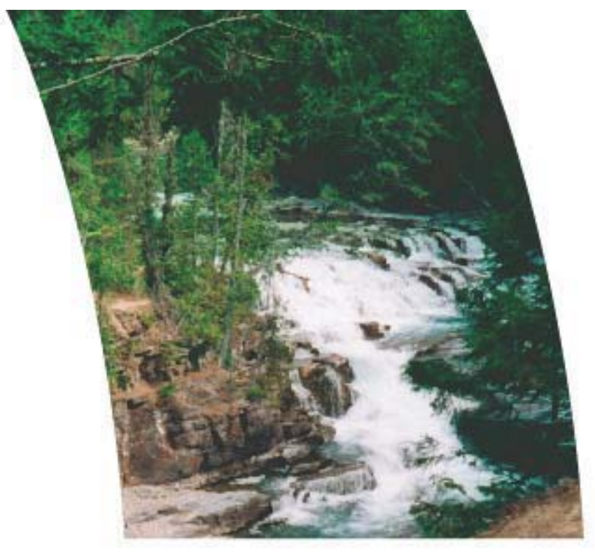
STATE OF THE WORLD'S FORESTS 2 0 0 3