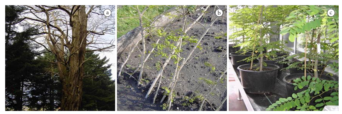
Figure 1. Preparation of experimental plants for the labelling experiments (a) Mother tree of the 4- to 17-year-old cuttings; (b) Root formation of the cuttings under field conditions; (c) Cultivation of the plants under controlled climate conditions in the greenhouse.

The radioactivity in the plant fractions was quantified by means of a scintillation counter (NAIS 3x5x16 LED detector, Canberra Industries). The samples were combusted in oxygen (Mod. 306 sample oxidizer, Packard Instruments) evolving the carbon as {}^{14}CO_2 . The radioactivity in each sample was expressed in terms of relative specific activity, which is the ratio of the specific activity in the sample (radioactivity per g dry weight) to the specific activity of the whole plant (Mor & Halevy, 1979; Zgallaï et al., 2006).