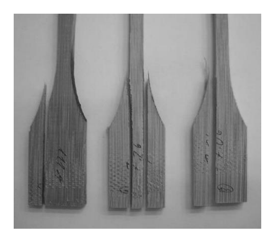
Figure 3. Specimens initially prepared for the tensile strength parallel to grain test.Figura 3. Corpos de prova inicialmente preparados para o ensaio de resistência à tração paralela às fibras.

Specimens initially built for the tensile strength test fractured due to shear stress in the grip section, as shown in figure 3. Thus, specimens were rebuilt with smaller width and thickness in the gauge section (as described in the methodology), obtaining the tensile rupture where expected.