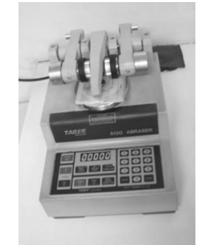
Figure 2. The Taber Abraser equipment used in the wear resistance test.

Figura 2. Equipamento Taber Abraser usado no ensaio de resistência ao desgaste abrasivo.